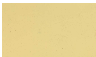
Tint 1:10 TiO 2